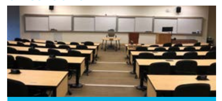
1213 - Seats 76