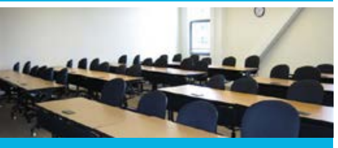
2310 - Seats 48