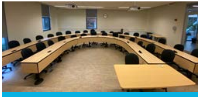
1302 - Seats 34